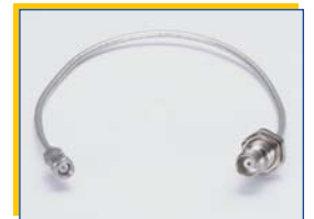
Semi-Rigid Cable Assemblies

The company's World Class Quality Management System (QMS) was one of the industry's first to be registered to ISO9001/2000. Semflex is highly process driven throughout the organization and utilizes SPC to monitor, control and continuously improve each process. Closed loop process improvement practices similar to Six Sigma, Kaizen and Lean Enterprise