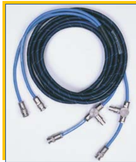
Custom Splitters and Power Dividers

We understand that you have a business to run, so we offer the fastest delivery in the industry: "Ship Same Day" service is available on 150+ standard in-stock products, and "48 hours or less" shipment is available on custom assemblies. Custom assemblies with COTS components often "Ship Same Day" when ordered before noon.