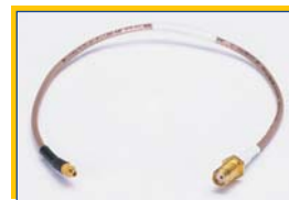
Micro Miniature Coax

allow us to reduce variation and minimize costs. As a consequence, our products, processes and QMS are site-qualified by many major well-respected companies.