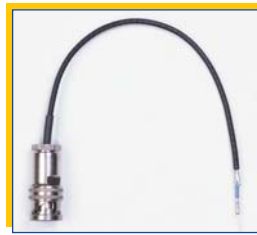
Ultra-Low Loss Triax

Because we are heavily involved in the design and manufacture of coax cable and connectors, we bring a higher degree of expertise to the task of manufacturing cable assemblies.